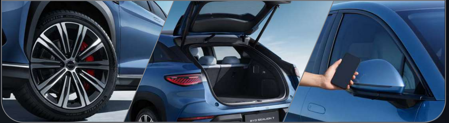
19-Inch Alloy Wheels