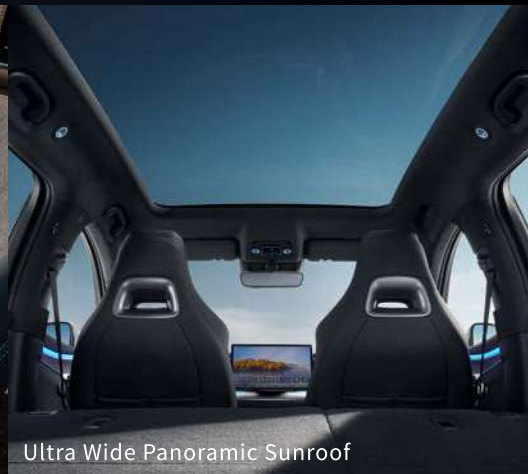
Ultra Wide Panoramic Sunroof