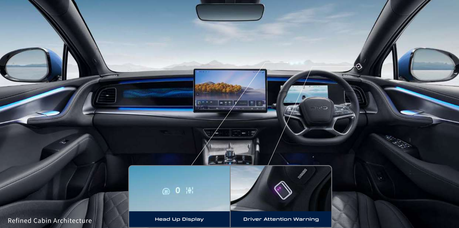
Refined Cabin Architecture