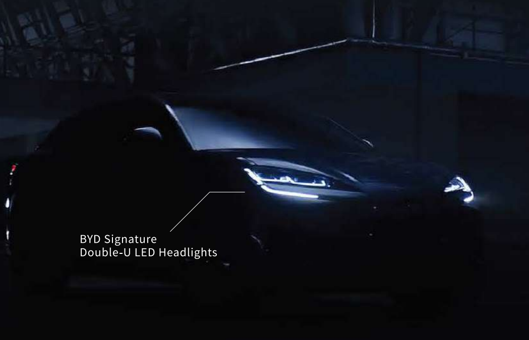
BYD Signature Double-U LED Headlights