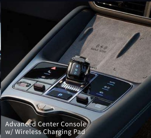
Advanced Center Console w/ Wireless Charging Pad