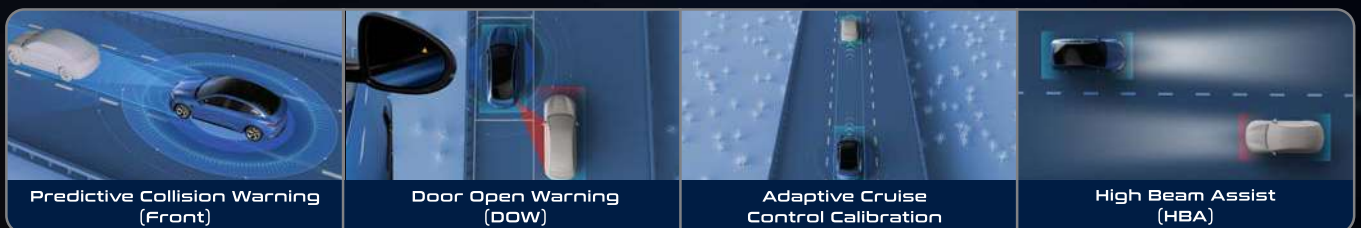
Predictive Collision Warning (Front)