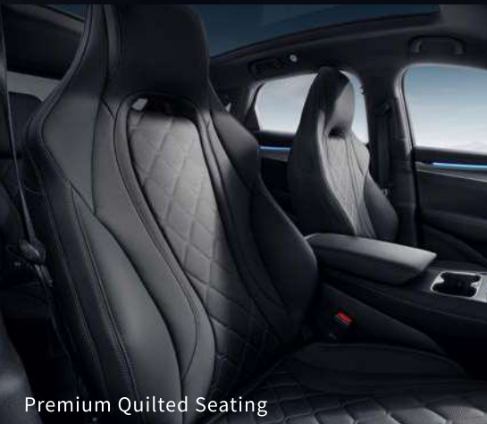
Premium Quilted Seating

BYD SEALION 7 embodies a bold vision of electric mobility with its sleek lines and commanding stance. Every detail, from the fluid design to the thoughtfully spacious interior, is designed to elevate the driving experience. Merging cutting-edge technology with a refined sense of style, the BYD SEALION 7 delivers not just performance, but an unmatched journey that redefines what an electric SUV can be.