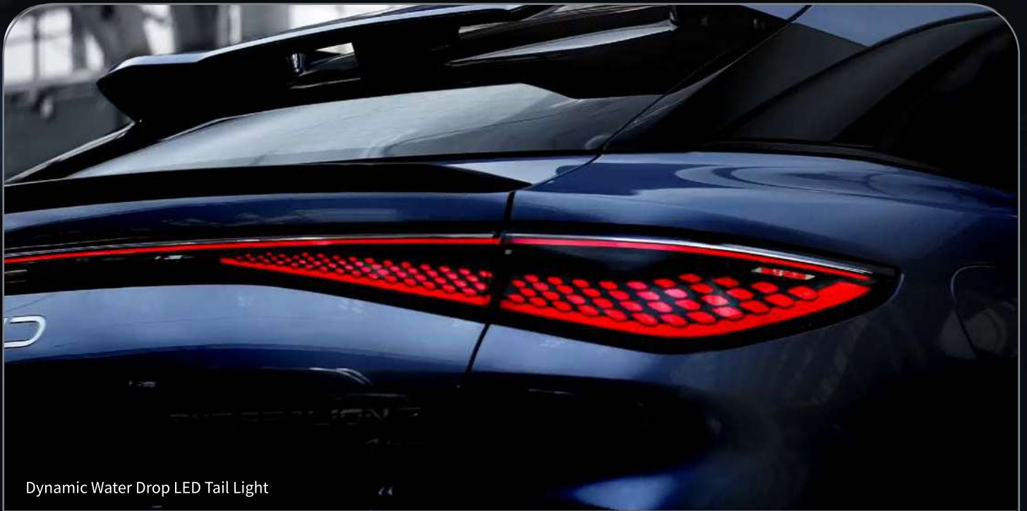
Dynamic Water Drop LED Tail Light